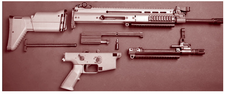
A partially disassembled SCAR-L (light version of the Special Forces Combat Assault Rifle).

Gun manufacturers are increasingly using polymers in the production of firearm parts such as handgun frames (primary structural components), largely due to their lower weight and cost. Unlike metal firearms, however, polymer guns are difficult to mark durably, as the ITI prescribes; arms traffickers who seek to make a polymer gun untraceable will normally succeed in doing so once they remove the serial number that the manufacturer has marked on the frame. Policy guidance is needed on issues