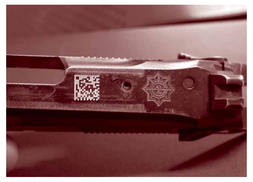
A two-dimensional data matrix code.

For all these reasons, 'old' firearms technology is proving surprisingly resistant to the changes that have recently transformed other products and industries. Whatever the future impact of technology on the firearms industry, it is also important to note that the huge number of small arms now circulating in the illicit market, very few of which feature new technology, will define the small arms problem for years to come. Irrespective of the advantages offered by many of the new systems, the same tried and tested methods remain key to small arms control. At the end of the day, the basics of weapons marking, record-keeping, and tracing, stockpile management, and diversion prevention, as