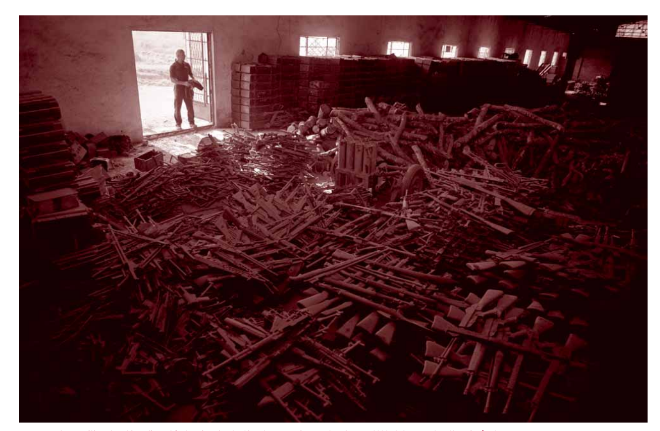
Weapons and ammunition stored in a disused factory in Lubumbashi, Katanga province, DRC, February, 2009.

Application to conflict and post-conflict situations. In the first instance, the BMS5 outcome document underlines the importance of stockpile management 'in settings of armed violence, transnational organized crime and conflict and post-conflict situations' (UNGA, 2014g, para. 6), a somewhat broader set of reference points than is typically found in PoA-related documentation relating to stockpile management. In several places, however, the document emphasizes the application of stockpile management to 'conflict and post-conflict situations', citing, in this regard, disarmament, demobilization, and reintegration (DDR) programmes, UN peacekeeping, and 'other relevant national programmes' (paras. 7-8, 17b).<sup>22</sup> The PoA does not explicitly link stockpile security and UN peacekeeping.<sup>25</sup> The fact that this connection is 'noted' in the BMS5 outcome (para. 7) represents something of a step forward—although earlier draft versions of the BMS5 outcome contained additional references to UN peacekeeping and related Security Council work.<sup>24</sup>