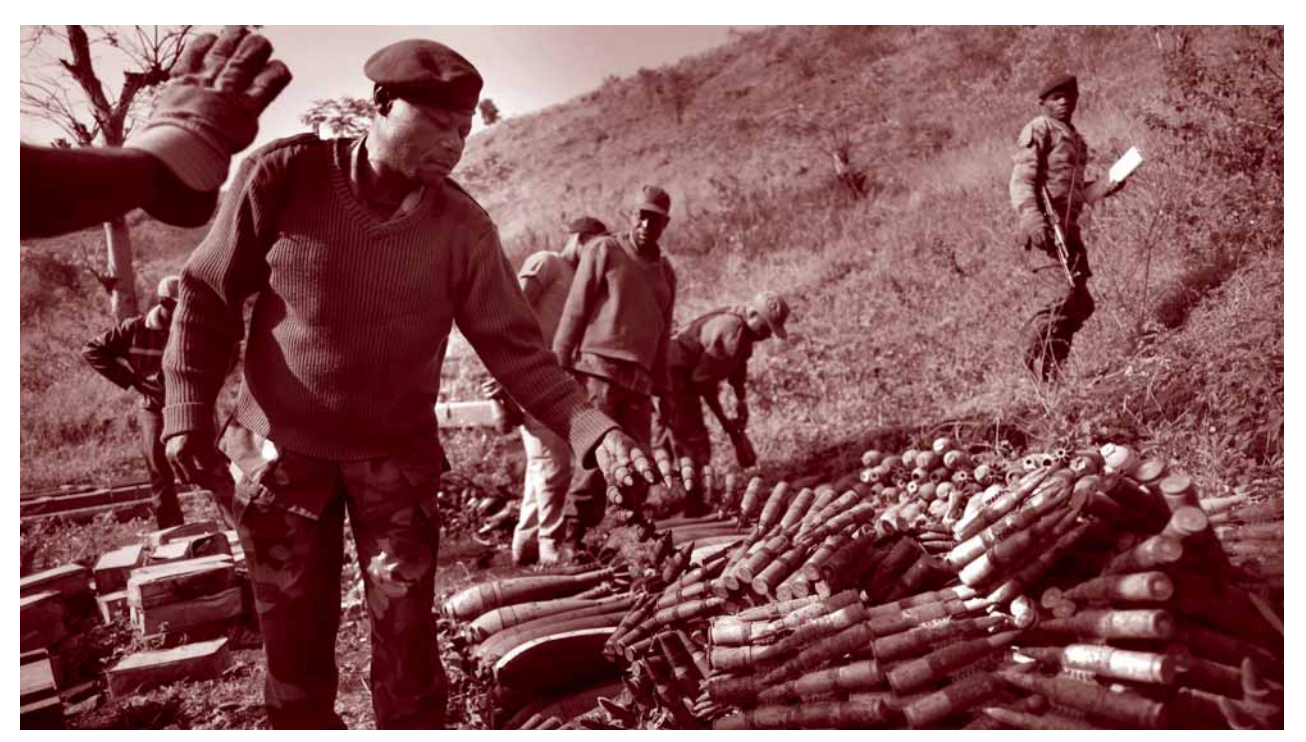
With assistance from soldiers, a MAG (Mines Advisory Group) team take munitions from an open-air stockpile for destruction, near Goma, DRC, September 2012.

While the real-world impact of BMS5 may thus remain unclear, the time and expense that went into the meeting can still be justified. In contrast to other arms control processes, <sup>106</sup> the UN small arms process continues to move forward—not by leaps and bounds, but in a relatively practical, focused way. All PoA meetings since BMS3, in 2008, have yielded substantive outcomes. <sup>107</sup> What was implicit (and ignored) <sup>108</sup> in the PoA and ITI—for example, weapons tracing in conflict and post-conflict settings—has been made explicit (and actionable).