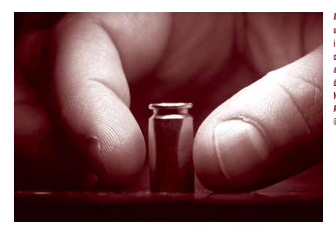
A shell casing is placed under a microscope to identify markings scored on it when fired from a handgun during a demonstration by the New York State Police, Albany, 2008.

Paragraph 21 of the BMS5 text highlights, in a general way, the utility of exchanging tracing information relating to conflict and post-conflict situations, as well as crime, while paragraph 27g calls for 'the enhanced exchange' of tracing information 'between relevant United Nations entities'. Both paragraphs cite the potential application of conflict tracing to 'the planning and imple-