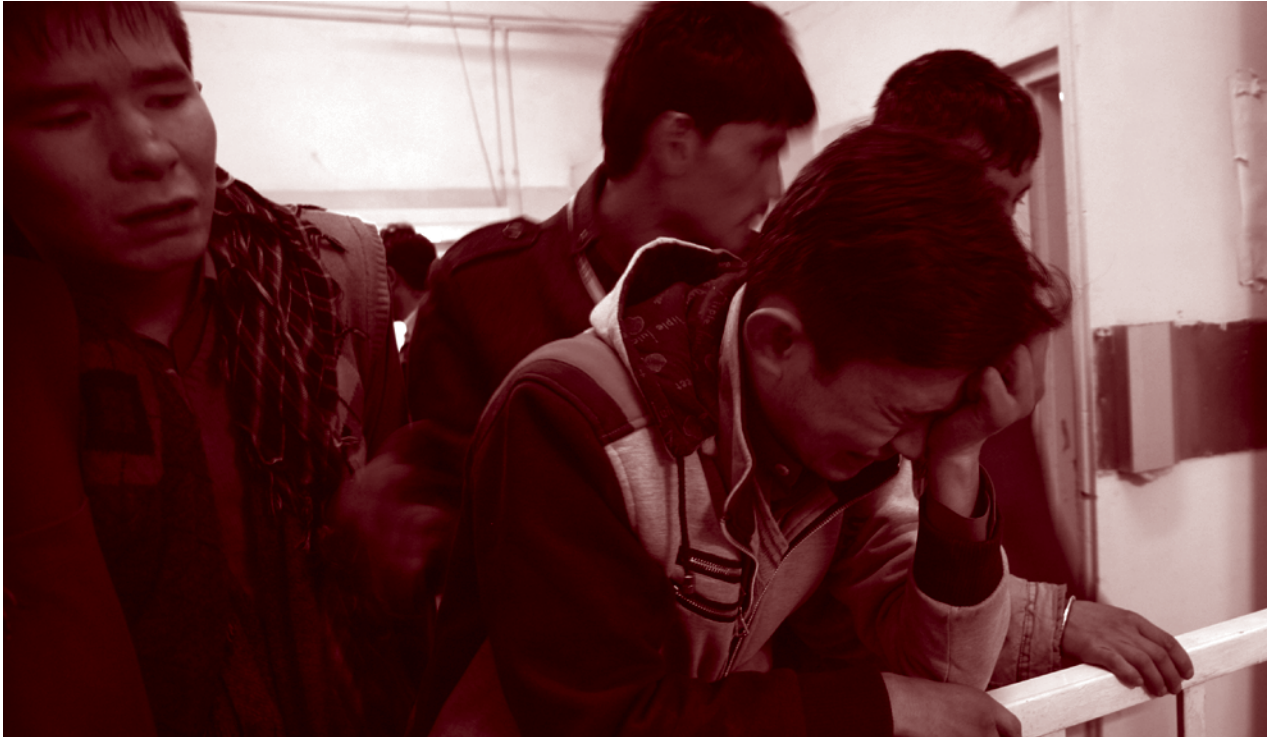
A man grieves for his brother who was killed in a bomb blast in Quetta, Pakistan, February 2013.

Some states are ill equipped to respond to widespread non-conflict violence, particularly if they suffer from poor governance or pronounced ethnic and social divisions (Malby, 2011, p. 107; SOUTH AFRICA). Some governments abuse their monopoly on the use of force, using violence against their population for policy ends. Such is the case, for example, when police use excessive force to stop demonstrations, political leaders employ gangs to quash opponents, or security forces conduct violent civilian disarmament campaigns. Countries that have weak institutions or that routinely use violence against civilians generally report high homicide rates (Malby, 2011, p. 103).