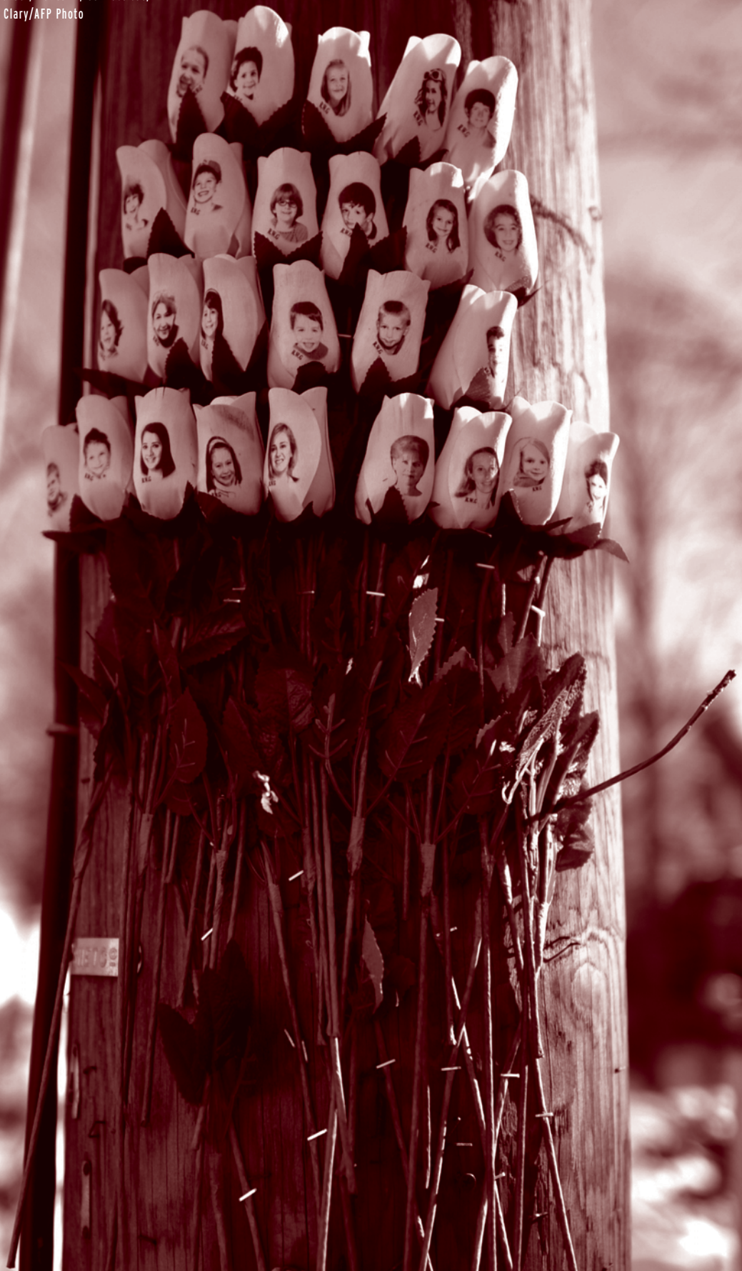
Roses bearing the faces of people killed in a shooting at Sandy Hook Elementary School, Newtown, Connecticut, January 2013.