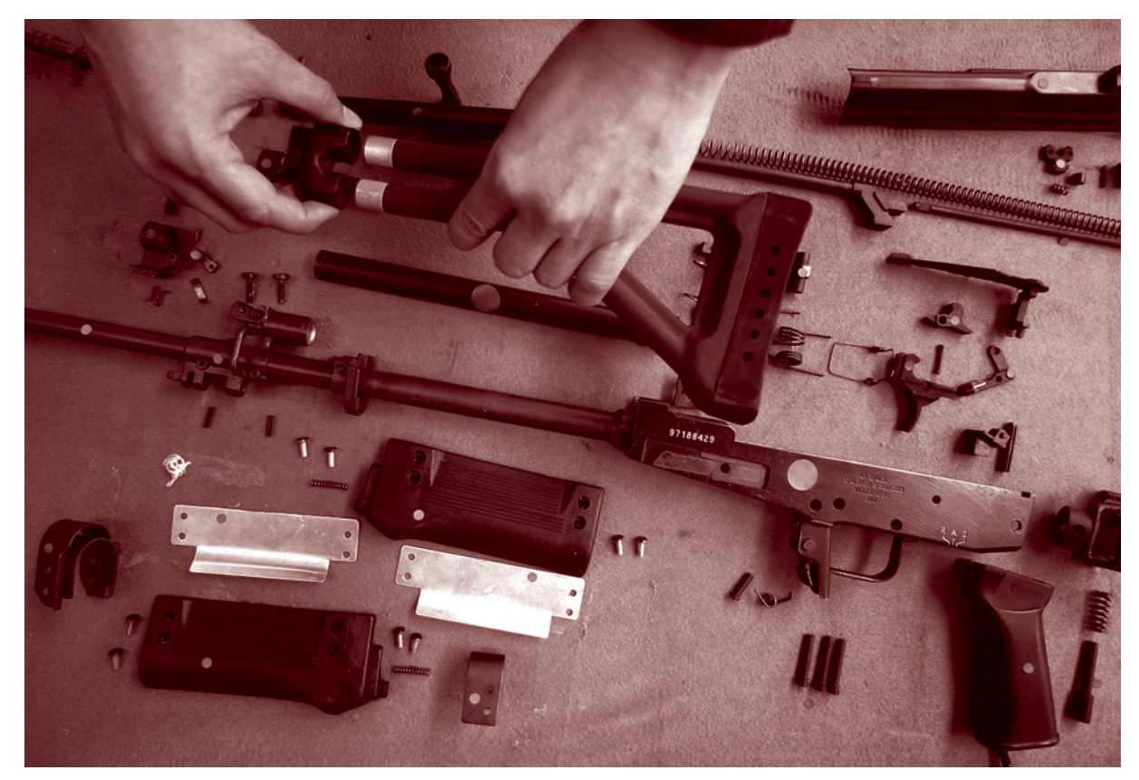
An employee of the Colombian weapons manufacturer INDUMIL (Industria Militar) displays the different parts of an assault rifle, May 2006.

The chapter begins with a brief summary of key terms and definitions, which is followed by an overview of the methodology used to generate the revised estimate for the value of international transfers. The chapter then looks at international transfers of parts and accessories for small arms and light weapons. The trade in parts is explored through an analysis of supply chains and import patterns. The assessment of accessories is divided into two sections. The first section provides a basic overview of five categories of major accessories, indicating how they work, who uses them, and how they are used. The second section sheds light on the trade in accessories through case studies: one on the civilian market for weapon sights in four South American countries and a second on procurement of accessories by the armed forces of six countries. The chapter concludes with a brief recap of major themes from the four-year study, including the need for greater transparency in the small arms trade.