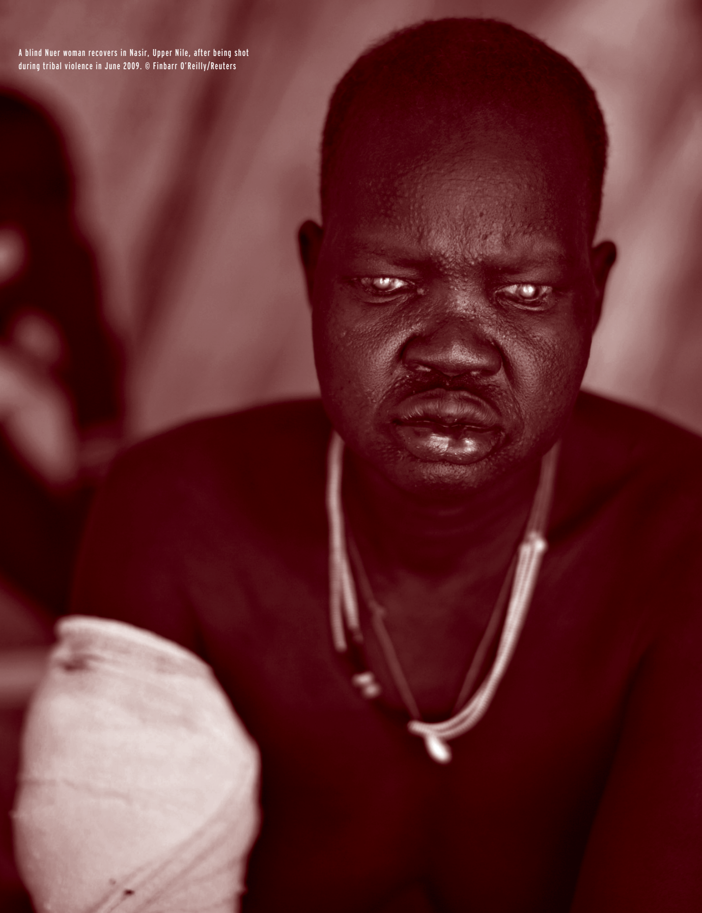
A blind Nuer woman recovers in Nasir, Upper Nile, after being shot during tribal violence in June 2009.