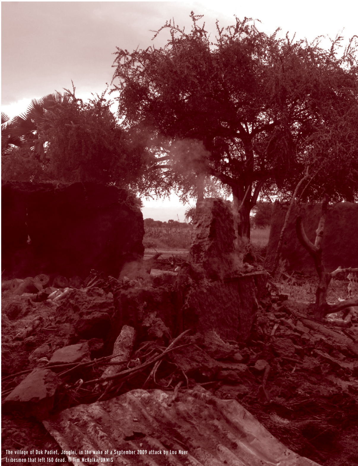
The village of Duk Padief, Jonglei, in the wake of a September 2009 attack by Lou Nuer tribesmen that left 160 dead.