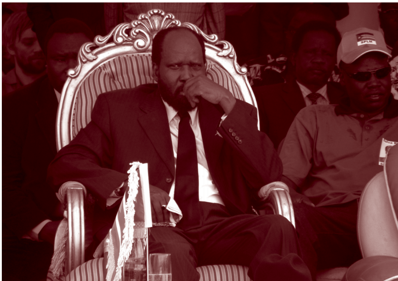
Salva Kiir presides over the launch of his re-election campaign for president of Southern Sudan, February 2010.

The parties are currently wrangling over the location of the Heglig and Bamboo oil fields, 84 with the GoSS claiming they are in Unity State (Southern Sudan) and the NCP saying they are in South Kordofan (Northern Sudan) (Hemmer, 2009, p. 12). An estimated 82 per cent of Sudan’s oil fields are deemed to be located in Southern Sudan,