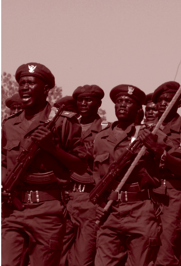
SPLA soldiers parade during celebrations marking the fourth anniversary of the Comprehensive Peace Agreement, Malakal, Southern Sudan, 9 January 2009.

Crucially, in each of the three most significant ceasefire violations since the CPA (twice in Malakal and once in Abyei in May 2008), the JIU components split and fought against one another. Their near-total lack of integration remains a huge concern. They also pose a risk in the likely event of a vote for Southern secession, since the SAF will have more than 15,000 JIU members stationed in Southern Sudan and strategic border areas. 64 These disgruntled (and probably unpaid) soldiers could easily become entangled in fighting.