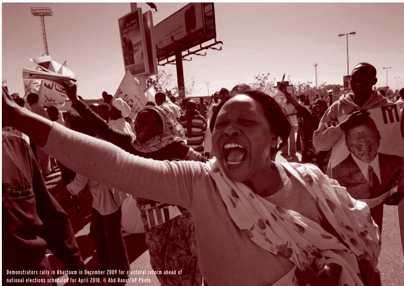
Demonstrators rally in Khartoum in December 2009 for electoral reform ahead of national elections scheduled for April 2010.

Other matches in the tinderbox could include forcible, ethnically targeted disarmament campaigns in the South, or the GoSS’s continued inability to provide basic services. Any of the armed entities reviewed in the chapter could be exploited by local, national, or regional powerbrokers in a return to full-scale armed conflict. The list is long and includes armed groups backed by Southern politicians, the SAF, SAF proxy forces, the SPLA, ‘private armies’, ex-SSDF factions within the SPLA, JIU components, and armed tribal groups and communities.