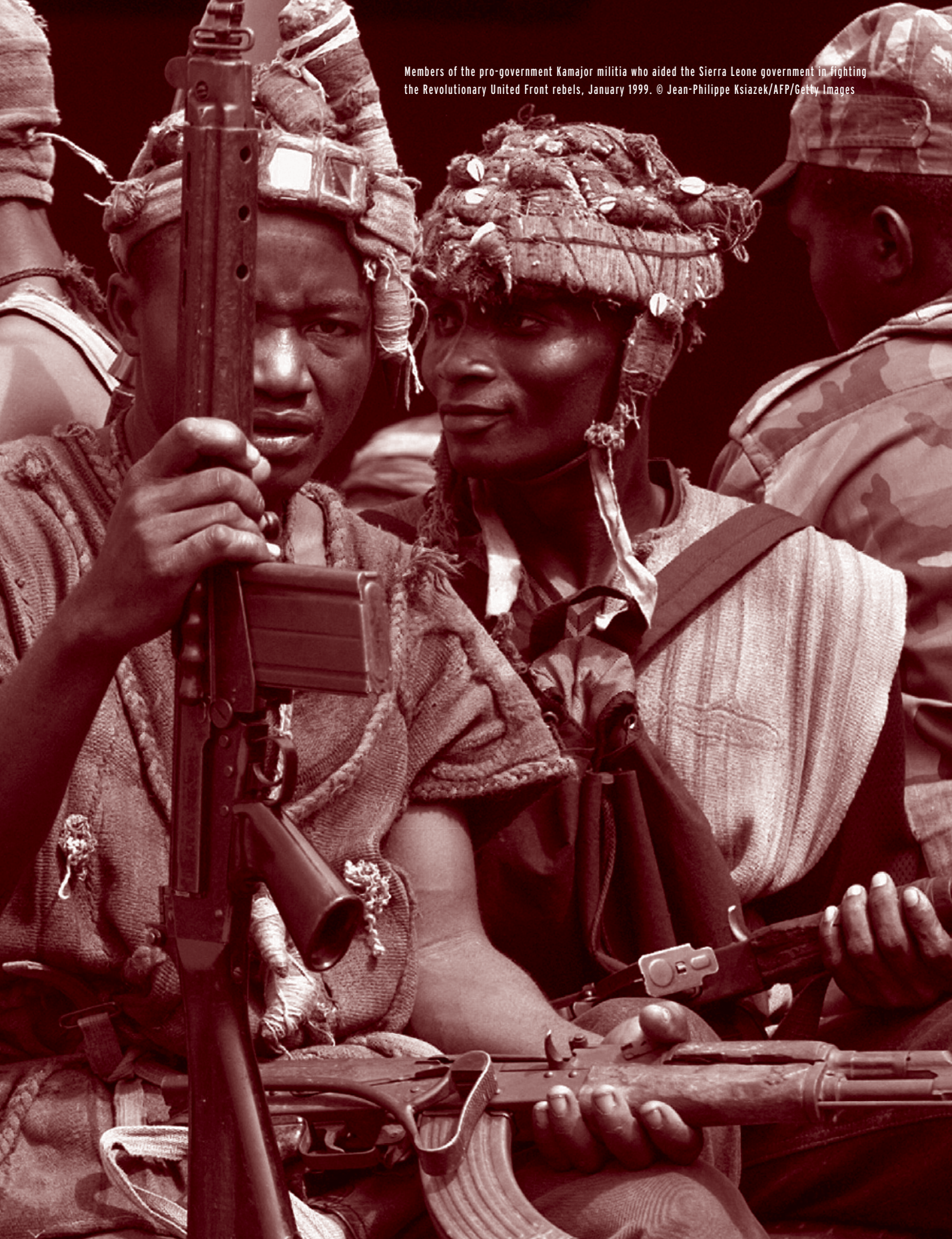
Members of the pro-government Kamajor militia who aided the Sierra Leone government in fighting the Revolutionary United Front rebels, January 1999.