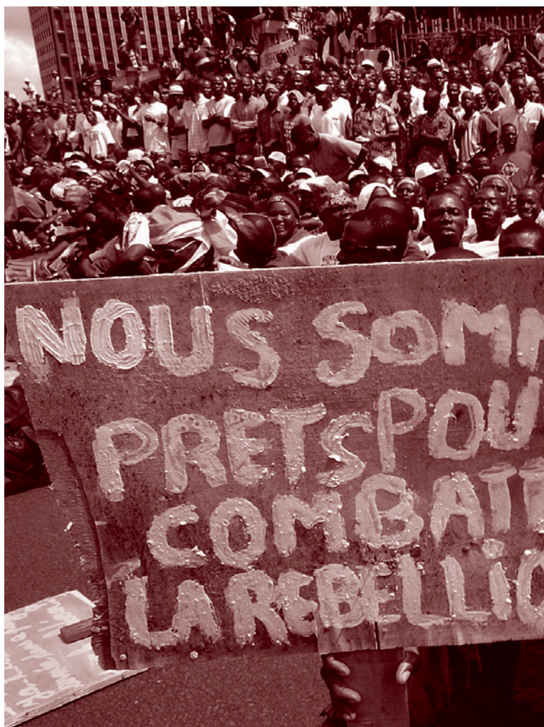
A pro-government ‘Jeune Patriote’ militia supporter holds a placard at a demonstration in Abidjan, Côte d’Ivoire, 4 November 2004.

Non-state armed groups come in many shapes and sizes. They vary in their purpose, composition, membership, organization, longevity, activities, and use of small arms. This makes it difficult to generalize about these groups or to provide a single definition that captures all of these important differences. There is no universal definition for ‘non-state armed group’. 2