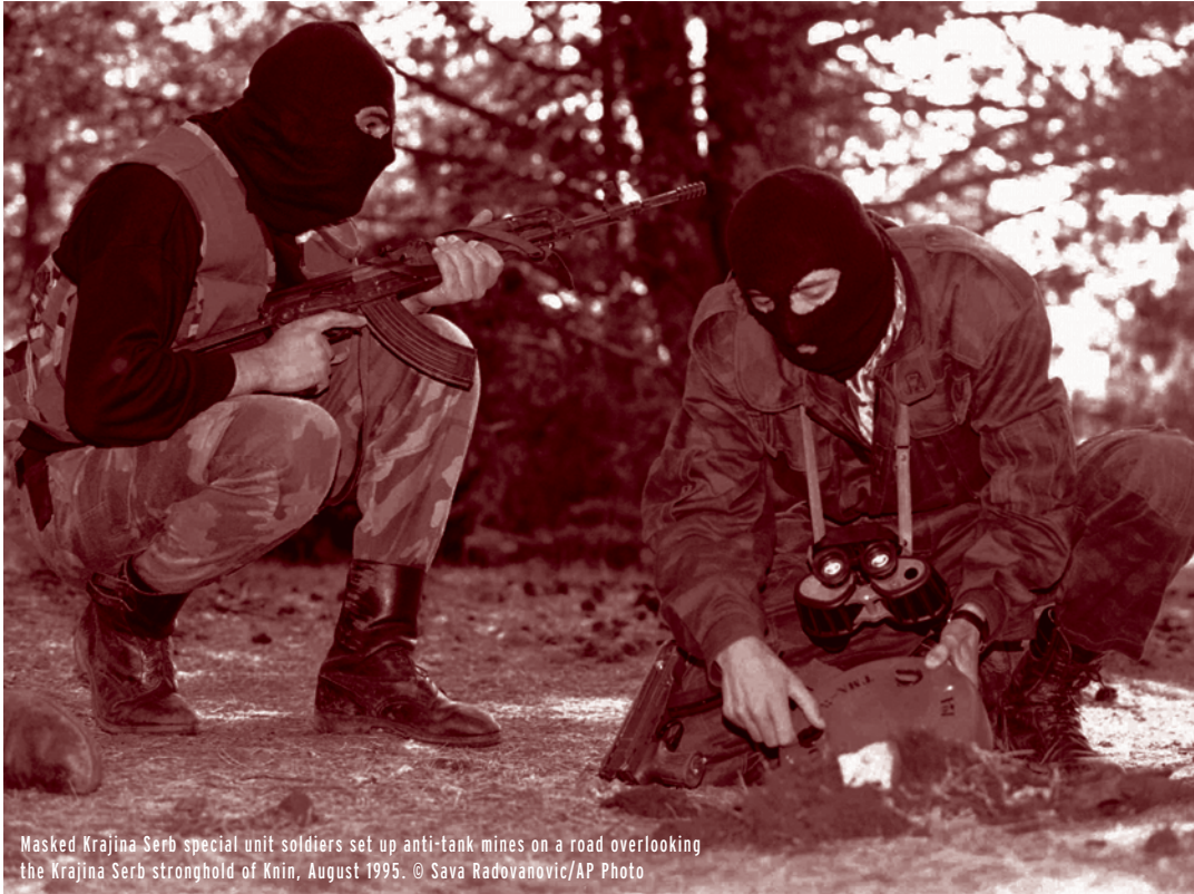
Masked Krajina Serb special unit soldiers set up anti-tank mines on a road overlooking the Krajina Serb stronghold of Knin, August 1995.

One of the most frequent uses of PGAGs is electoral violence, which remains extremely common across the globe despite the fact that most countries today are democracies (see Box 10.5). Many politicians and political parties use electoral violence to gain political power and to solidify the power of the regime. Elections in Africa since 2000 have been violent more often than not, with more than two dozen states holding elections during this period, and more than half of them involving serious violence (Simpson, 2009). Despite the democratic structure of most states in Africa, elections have not yet become political struggles for power, as is common in consolidated democracies. Instead, demonstrations of state power and outright violence continue to underscore the nascent nature of democracy on the continent. Electoral violence has involved bombings, burnings, attacks on opposition leaders and voters, inter- and intra-party clashes, extra-judicial killings, assassinations, shootings, and ethnic clashes.