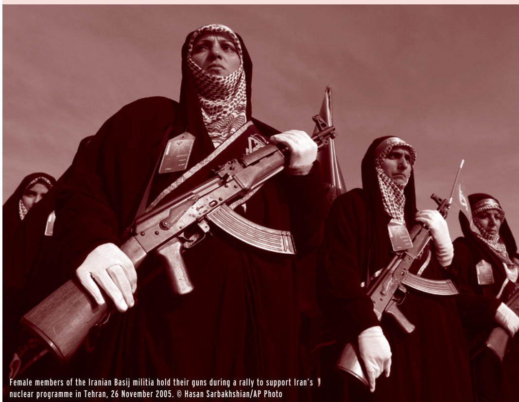
Female members of the Iranian Basij militia hold their guns during a rally to support Iran's nuclear programme in Tehran, 26 November 2005.