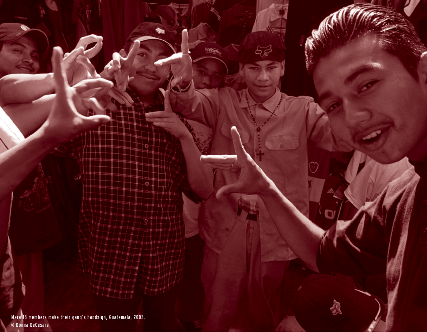
Mara 18 members make their gang's handsign, Guatemala, 2003.

and weapons because they are less likely to be stopped by the police or military. They also engage in theft, graffiti, carjackings, drive-by shootings, and clashes with other gangs, in particular female members of other gangs. Women and girls have also fought on the front lines with rebel groups and joined the ranks of suicide bombers.