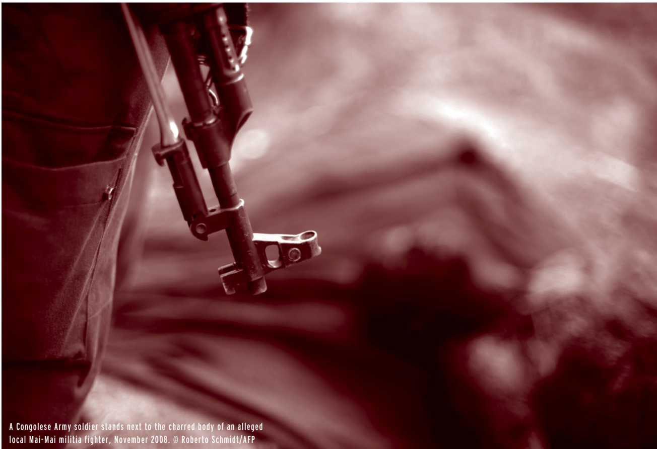
A Congolese Army soldier stands next to the charred body of an alleged local Mai-Mai militia fighter, November 2008.

Armed groups go by many names. Positive labels, indicating that the group has some legitimacy in taking up arms, include: revolutionaries, liberation movements, freedom fighters, militias, community volunteer organizations, and community defence forces. More negative labels, hinting at the illegitimacy or illegality of the group, include: terrorists, rebels, insurgents, criminals, gangs, bandits, and warlords. 6 Since the same group can be called both a