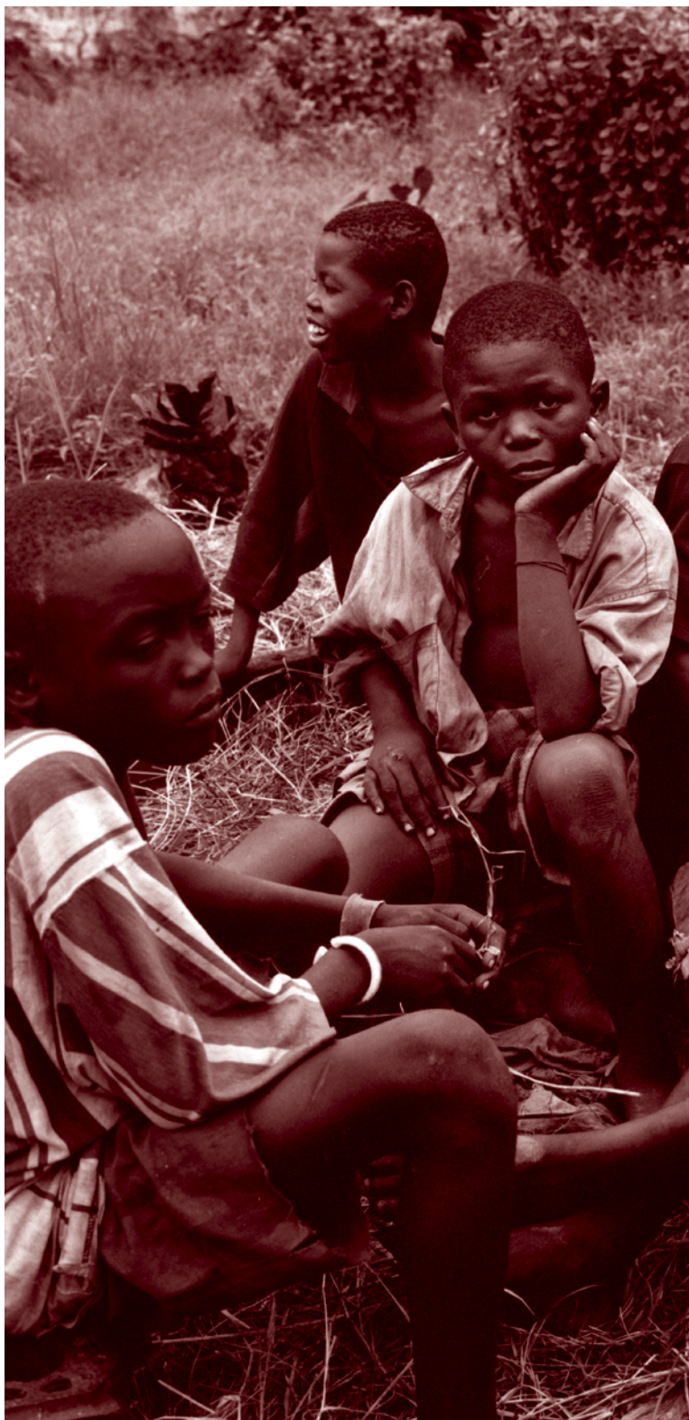
Street kids from a gang in Kinshasa, June 2001.

Prison gangs originally represented a distinct form of gang, largely removed from broader discussions of threats to the public.