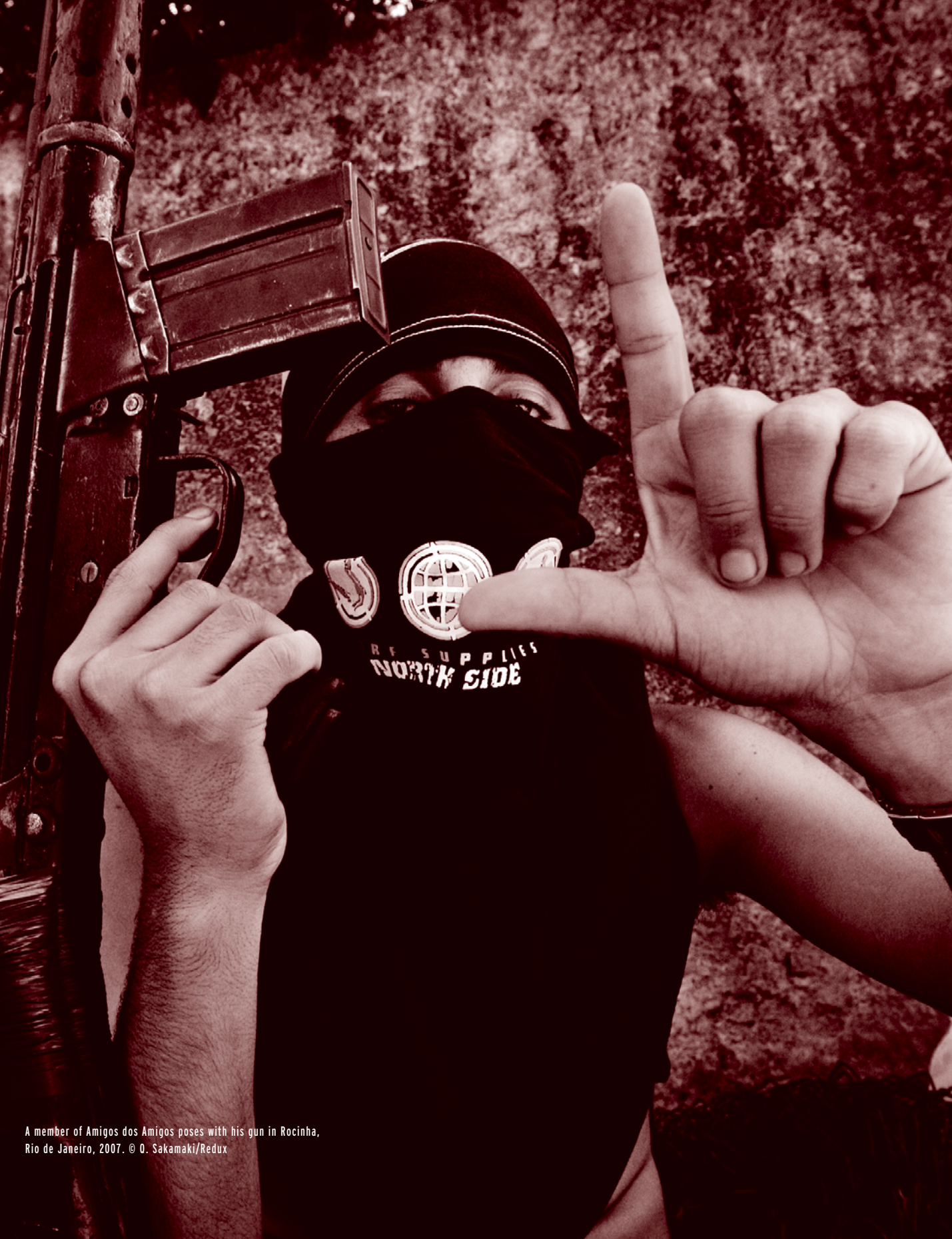
A member of Amigos dos Amigos poses with his gun in Rocinha, Rio de Janeiro, 2007.