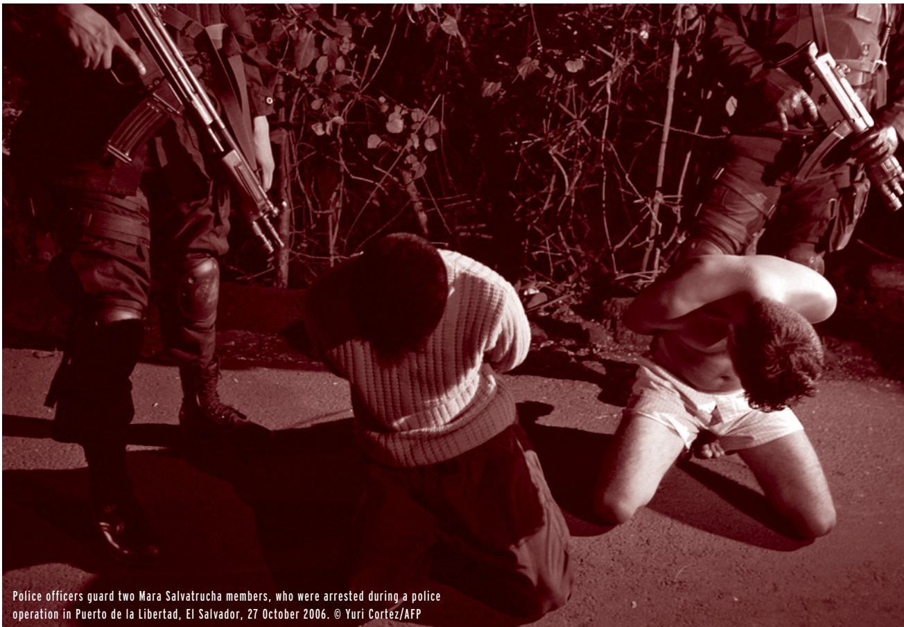
Police officers guard two Mara Salvatrucha members, who were arrested during a police operation in Puerto de la Libertad, El Salvador, 27 October 2006.

SER PAZ, a local organization based in Guayaquil, where the level of gang violence is particularly high, has taken a different approach to gangs. SER PAZ has sought to employ Ecuadorean gangs' own organizational and control