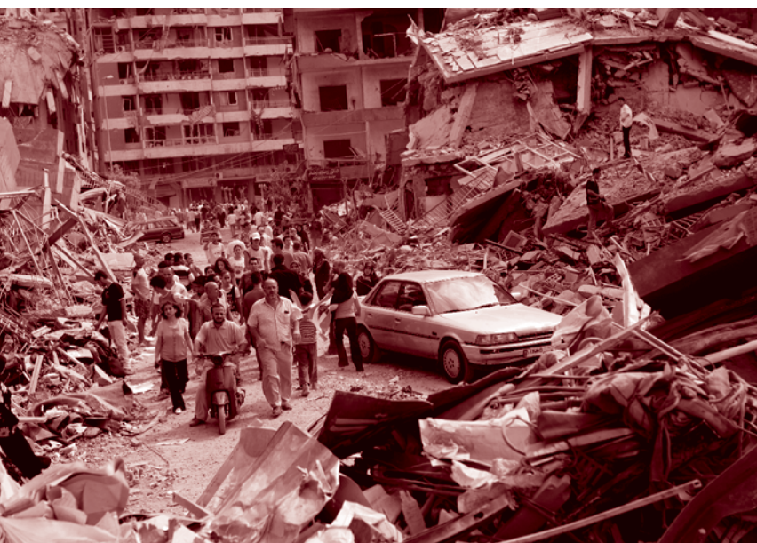
Residents of the Haret Harek neighbourhood in Beirut return after the ceasefire to find their homes and businesses reduced to rubble, 14 August 2006.

Although Hizbollah and allied parties (the March 8 political coalition) have dominated recent elections in the south, it is unclear how much popular support the various