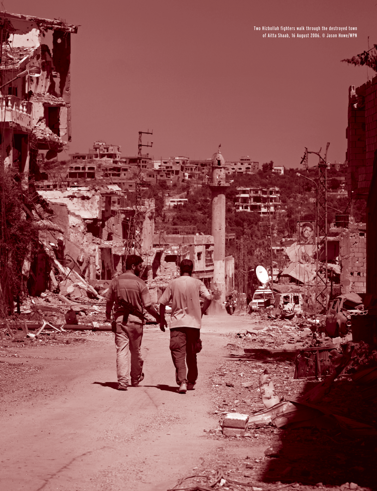
Two Hizbollah fighters walk through the destroyed town of Aitta Shaab, 16 August 2006.