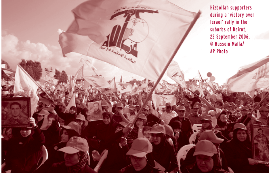
Hezbollah supporters during a ‘victory over Israel’ rally in the suburbs of Beirut, 22 September 2006.

For these reasons the post-conflict label is hard to apply to Southern Lebanon. Both parties remain in a state of high readiness, have suggested that future conflict is likely, and continue to call for the destruction or elimination of one another. There is no ‘peace process’ to serve as a guide for conflict resolution, generally a prerequisite for moving from war to peace. While several countries, led by the United States, have begun to support the reform of Lebanon’s state security apparatus as a means of counter-balancing Hezbollah’s semi-autonomy (Worth and Lipton, 2008), it is not clear how this effort will play out in the south of the country.