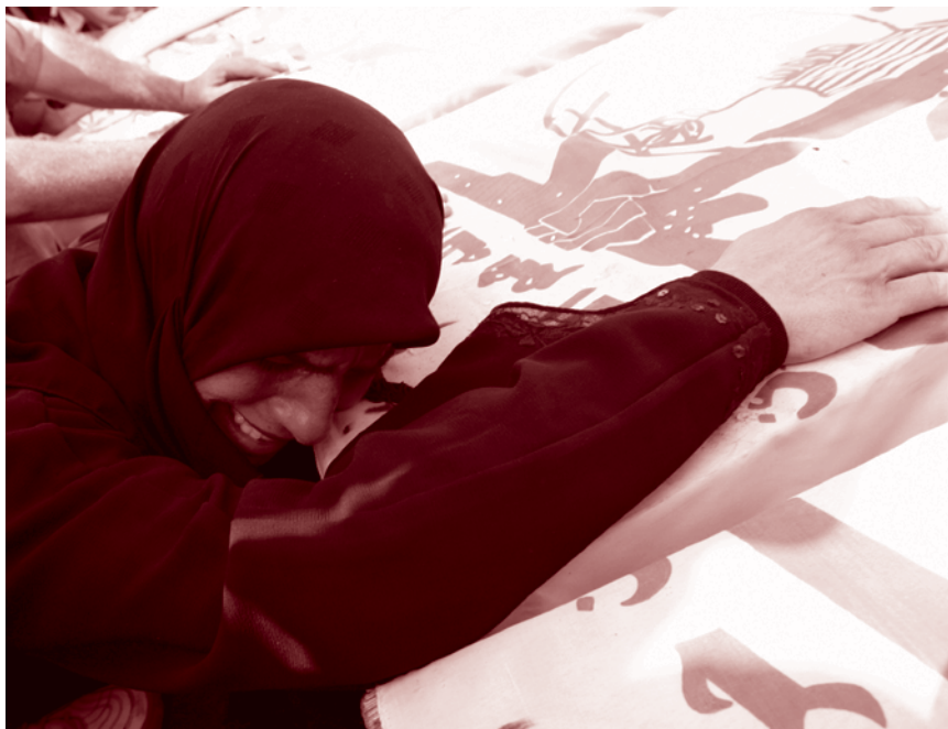
A woman mourns for family members killed as a result of the 2006 war, Harees, August 2006.

Injury as a result of the war was more common. Survey results indicate that 0.9 per cent of all individuals suffered significant physical harm as a result of the war, representing 4.7 per cent of total households. It is estimated, therefore, that 5,800 (+/- 1,400) people were injured as a direct result of the war. 11 Estimates of the number of war casualties are probably too low, however, as interview teams were not allowed to enter Bint Jbeil, reportedly a hard-hit location.