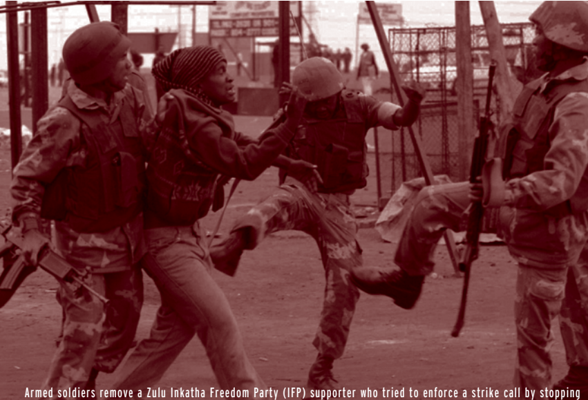
Armed soldiers remove a Zulu Inkatha Freedom Party (IFP) supporter who tried to enforce a strike call by stopping traffic into Johannesburg in March 1996. About 7,000 armed Zulus staged a protest in Johannesburg to commemorate the 'Shellhouse Massacre', during which eight IFP supporters were gunned down in 1994.

The auditor general's annual reports on the SANDF provide a less rosy picture. The 2006 Report of the auditor general complained of the SANDF's 'lack of monitoring compliance with policies and procedures relating to stock