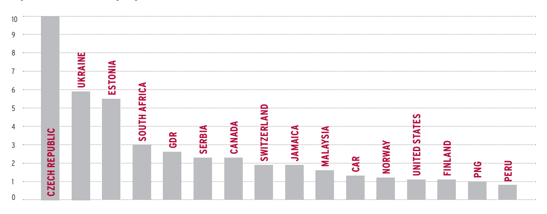
Figure 3.1 Small arms per person, selected armed forces