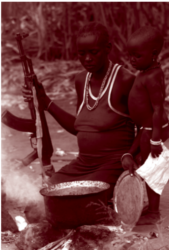
A woman armed with a Kalashnikov prepares an evening meal with her child in a homestead in Rumbek, 900 km south of Khartoum, in September 2003.