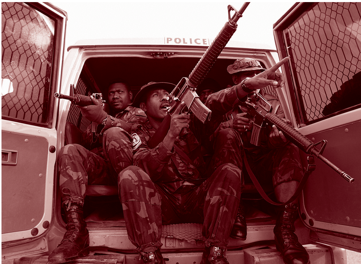
PNG police brandish M-16s as they patrol the streets for raskol gangs in August 2004.

Armed violence in Papua New Guinea is not evenly distributed, but rather concentrated in particular areas. In fact, Port Moresby—the country's fastest growing urban centre, with a population exceeding 300,000—now accounts for more than 30 per cent of all nationally reported crimes despite registering only 5 per cent of the country's population. Much of the crime is concentrated in Port Moresby's squatter settlements, where unemployment is high and service provision poor. The situation in the Southern Highlands, arguably Papua New Guinea's most troubled province, is equally disconcerting. There, the past decade has witnessed declining service delivery coupled with a dramatic upsurge in armed violence—coinciding for the most part with the advent of large-scale resource extraction activities.