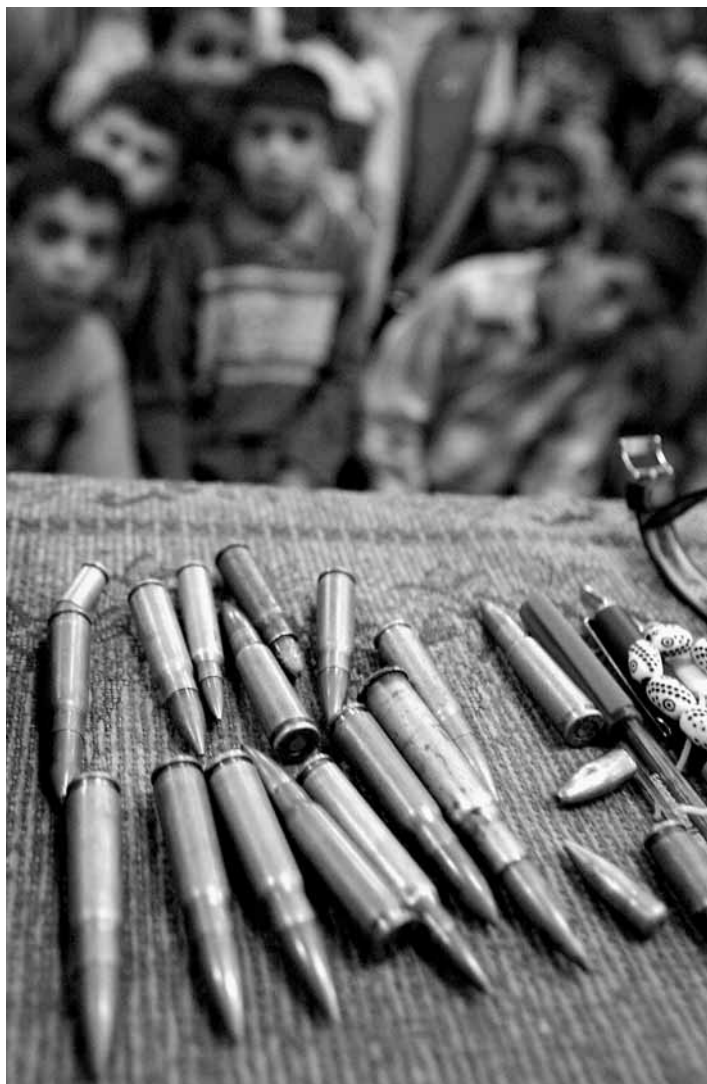
Palestinian children look at bullets donated to Hamas activists during a campaign in the Gaza Strip in April 2004.

Without ammunition, small arms lack the power to threaten, injure, and kill. This simple fact suggests that the international community—concerned with the impact of armed violence on human security—should pay as much attention to the projectile as to the object that fires it. Regardless of its critical role in conflict, however, ammunition has so far been neglected in the arms control debate, and that despite preliminary efforts undertaken in 1999 by the UN Group of Experts on the problem of ammunition and explosives.