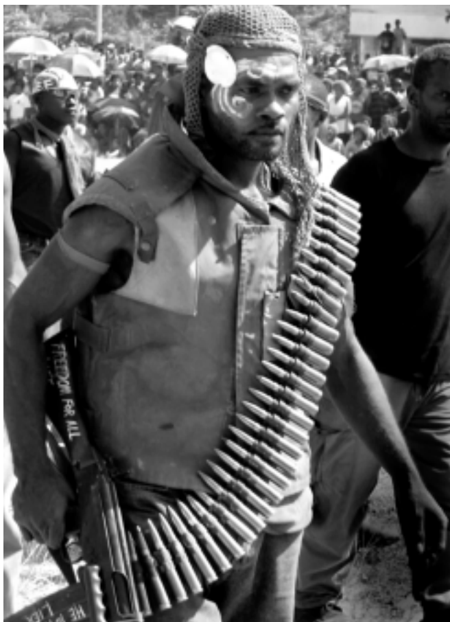
A former member of the Malaitan Eagle Force carries his gun after the group agreed to surrender their weapons in the Solomon Islands in August 2003.