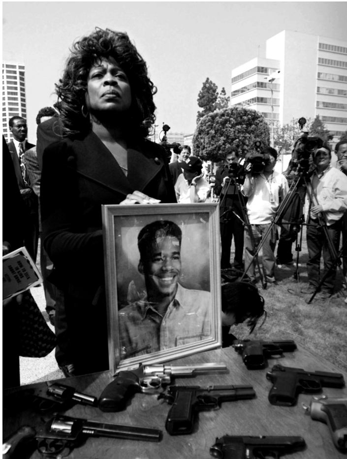
A woman holds up a photo of her son, who fell victim to gun violence in 1993, during a news conference in Los Angeles in May 1999.

Armed violence, gun suicide, and unintentional shootings are a global concern, even in nations at peace. State agents wield small arms to violate, directly and indirectly, a wide range of human rights, including the rights to life, liberty, and security of person.