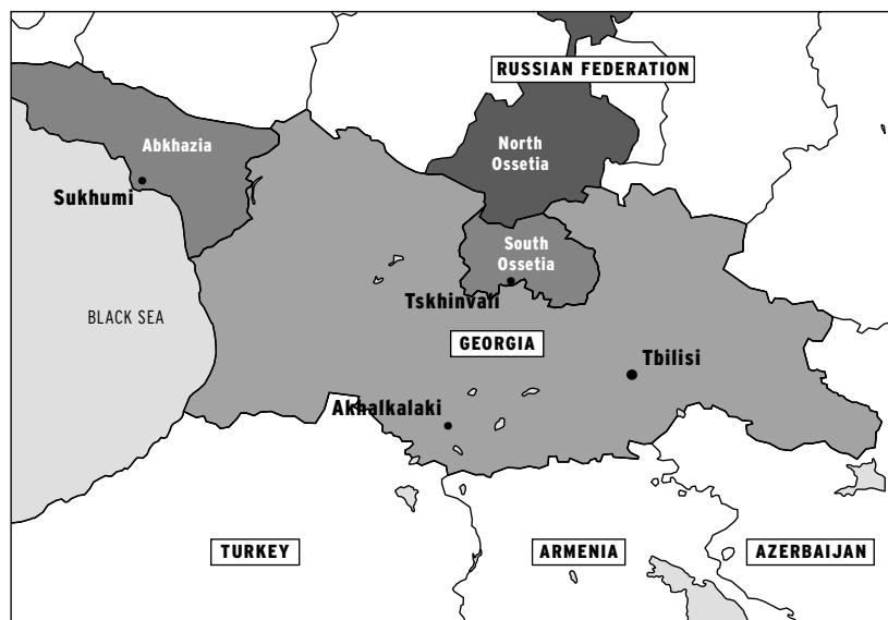
Map 6.1 Republic of Georgia

During the Georgian conflicts of independence, the availability of small arms changed dramatically. In the early period from 1989 to mid-1991, few small arms were available and the sources of supply were primarily non-military. From mid-1991 onwards, however, public institutions disintegrated, including the Russian armed forces. Small arms suddenly became widely available through massive leakages from Russian military bases and through a thriving regional trade involving Azerbaijan and Armenia, as illustrated by decreasing small arms prices after 1991.