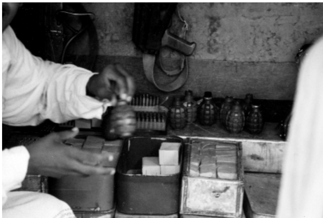
© Derek Miller Weapon sales from the back of a truck.

Weapons play a role as actual instruments used in conflict, but also as a statement about identity.