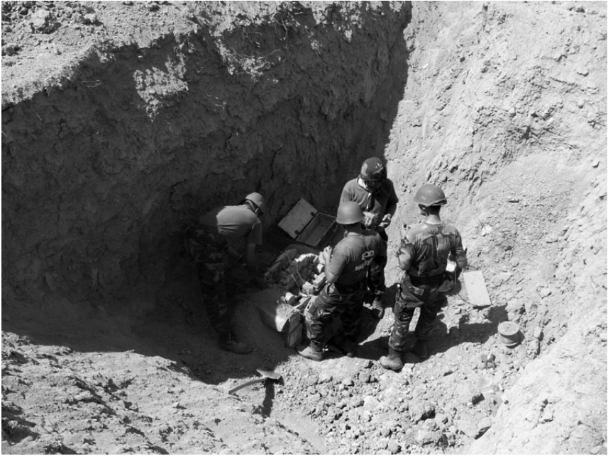
OD preparation.

1,080 (USD 23) (Macedonia, 2011d, p. 2; 2011e, slide 6). It is unclear whether the ammunition is dismantled in Krivolak or Erebito (see next section).