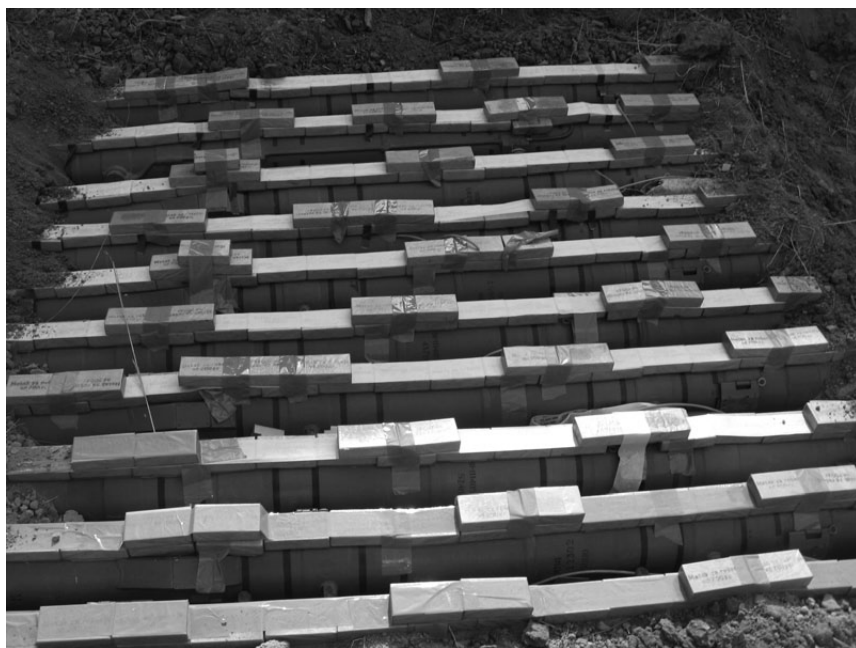
M114 Šturm missiles before destruction.