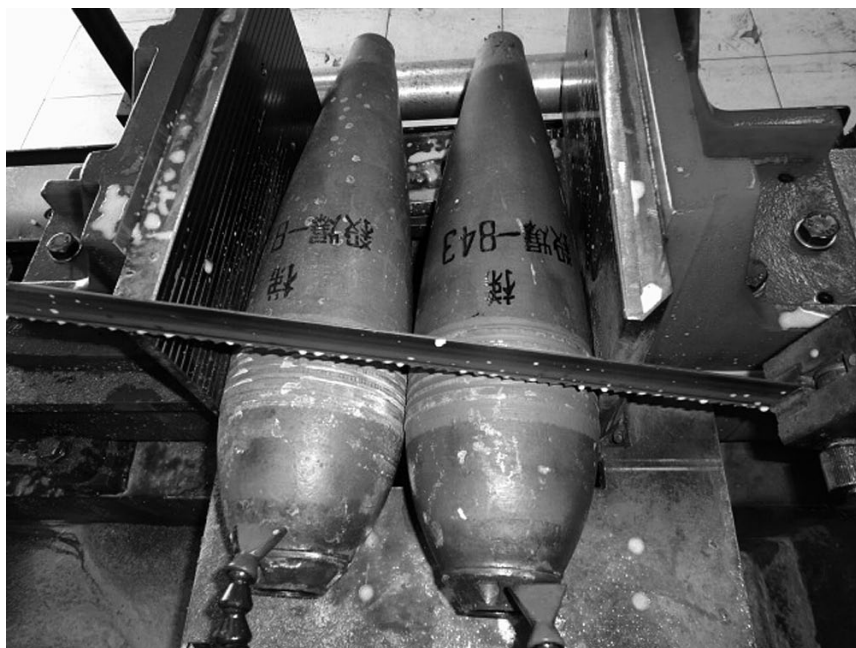
Industrial bandsaws used for the disposal of 82 mm, 120 mm, and 160 mm mortars.

zation of specified types of munitions (NAMSA, 2011, slides 14–15). It also allowed for site-wide improvements in infrastructure to enable the factory to operate safely at a significantly increased overall capacity. As at May 2011, ULP Mjekës operated four demilitarization lines (Albania, 2011a, slide 11):