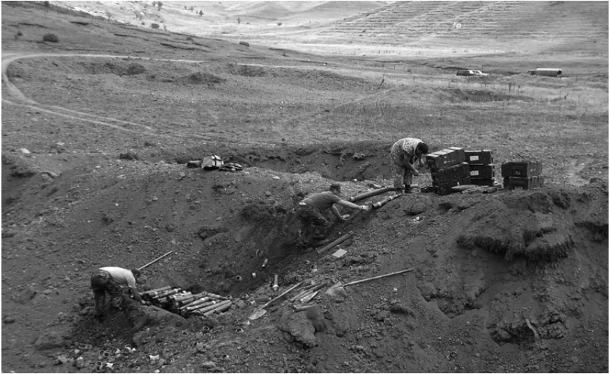
Open-pit demolition, Bizë, September 2009.