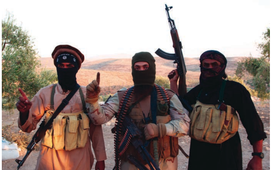
Jubhat Al Nusra fighters outside of Aleppo, Syria.