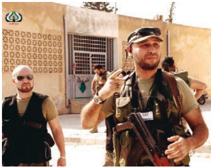
Libyan fighters: Mehdi al-Harati (former mayor of Tripoli), Syria, 2012.

Morocco is considered one of the most stable countries in the North African region. Despite this, Moroccan citizens have frequently participated in the conflicts that shaped modern 'jihadist' thought and doctrine: Afghanistan, Bosnia, Chechnya, and Indonesia (Rogelio and Rey, 2007). 17 Moroccan fighters ascribe their presence to noble aims: to fight against the oppressive Assad regime, to restore justice (specifically Sharia law), and to promote jihad in Syria (ONERDH, 2014). Research suggests, however, that socio-political and economic reasons may be among the factors that ultimately drive Moroccan participation in the Syrian conflict.