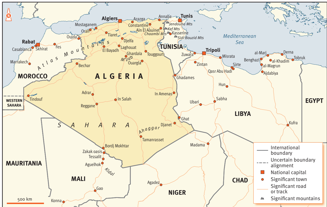
Map 1 Algeria and its neighbours

In the case of Algeria's Tuareg community, which is linked into both Libya and Mali's current crises, Algiers has not forgotten Paris' strenuous efforts in 1957–62 to insulate the Sahara from northern Algeria in the hope of retaining access to its natural resources after decolonization (Guichaoua, 2015, p. 321; Vaïsse, 2012, p. 283). President Charles de Gaulle long tried to 'internationalize' the oil-rich expanse, albeit to no avail (Home, 2006, p. 475). As a result of this history, many Algerians, to this day, believe that the French still do not regard Algeria's national territory as indivisible. They fear Paris might, if an opportune geopolitical environment arose, lend direct or indirect support to ethnic minorities' aspirations for self-determination, with the unstated purpose of diminishing the central government's control over parts of the nation's territory. 10 This perceived 'return' of an activist France in the Maghreb-Sahel since 2011 must be acknowledged if one wishes to understand Algerian thinking on Libya. For instance, several Paris officials and commentators said that 2011's NATO military campaign there made it possible for France and Great Britain to 'rectify the bad memory that was the Suez Crisis' of