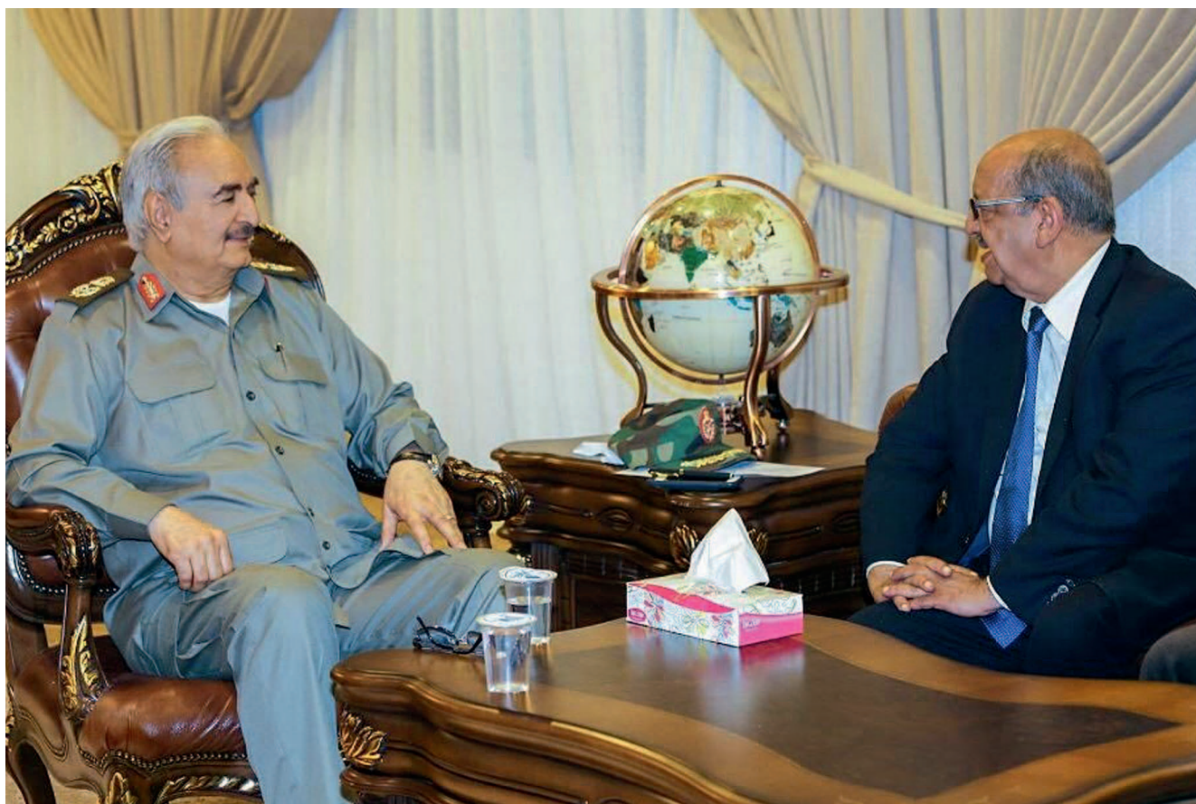
Photo 4: General Khalifa Haftar meets with Abdelkader Messahel, Algerian Minister of Maghreb Affairs in Benghazi, April 2017. This meeting was a follow-up to their earlier meeting in December, 2016.

The idea that Haftar, or a leader with similar attributes, may end up ruling all of Libya, did not elicit a strong controversy among the Algerians interviewed for this Briefing Paper. The Algerians are distinguished from the other states that provide military support to Libya’s counter-revolutionary factions by their scepticism about how, when—and at what costs