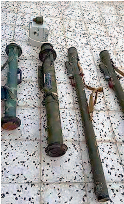
Photo 1: Photo published by Haftar's army featuring two Strelas allegedly recovered from an area under BDB control in July 2016. Note that neither gripstocks nor batteries appear in the photograph. The photograph was released by the LNA after the LNA Air Force helicopter, which was carrying DGSE operatives, crashed.