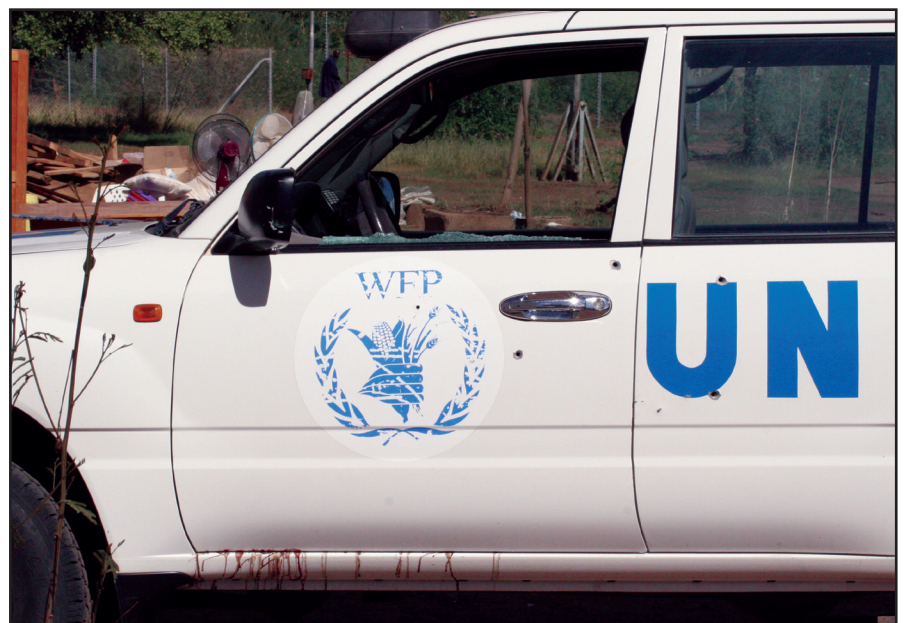
A blood-stained and bullet-holed World Food Programme Landcruiser at the scene of the killing, UN compound, Lokichoggio, Kenya, 14 May 2008.

The paper concludes that with or without the supply of government