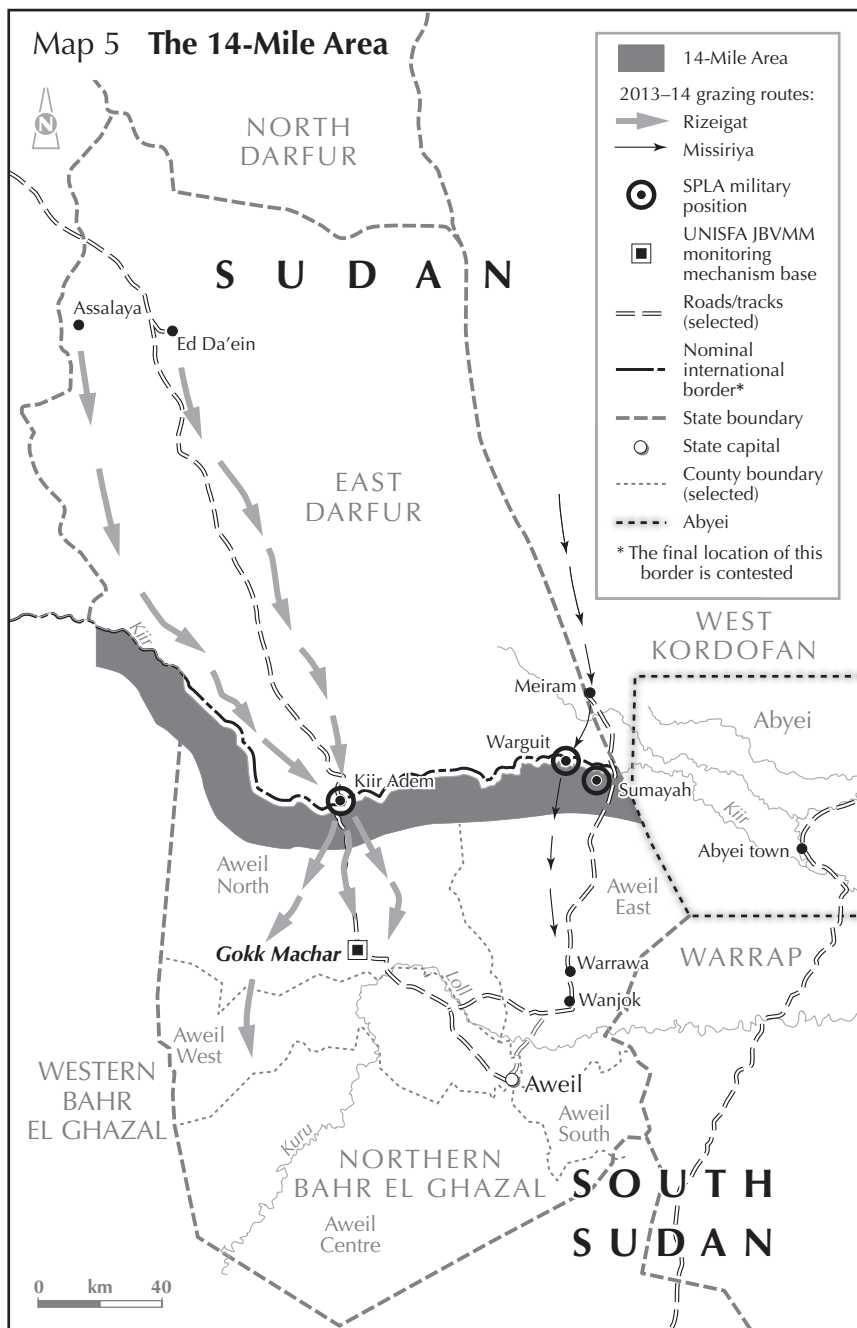
Map 5 The 14-Mile Area