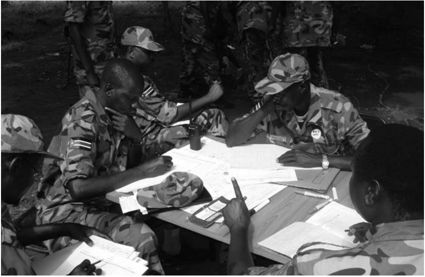
SPLA officers during training at Malou Command and Staff College, 2008.