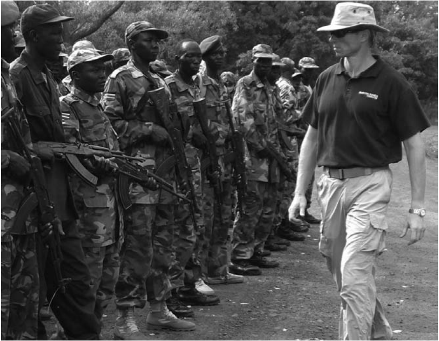
The author with SPLA non-commissioned officers during a course at Mapel Training Centre, 2009.

Although defence transformation is acknowledged as a ‘long process and not an event’, 22 the SPLA adopted conventional military formations on a large scale and over a short period of time. On paper, therefore, the army transformed from a guerrilla force to a conventional army in a matter of months. Yet with insufficient resources, underdeveloped administrative processes, a lack of understanding of conventional military theories among the majority of officers, and limited training and discipline in parts of the army, it has faced significant transformation challenges ever since.