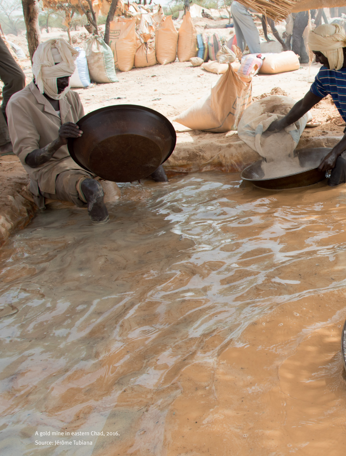
A gold mine in eastern Chad, 2016.