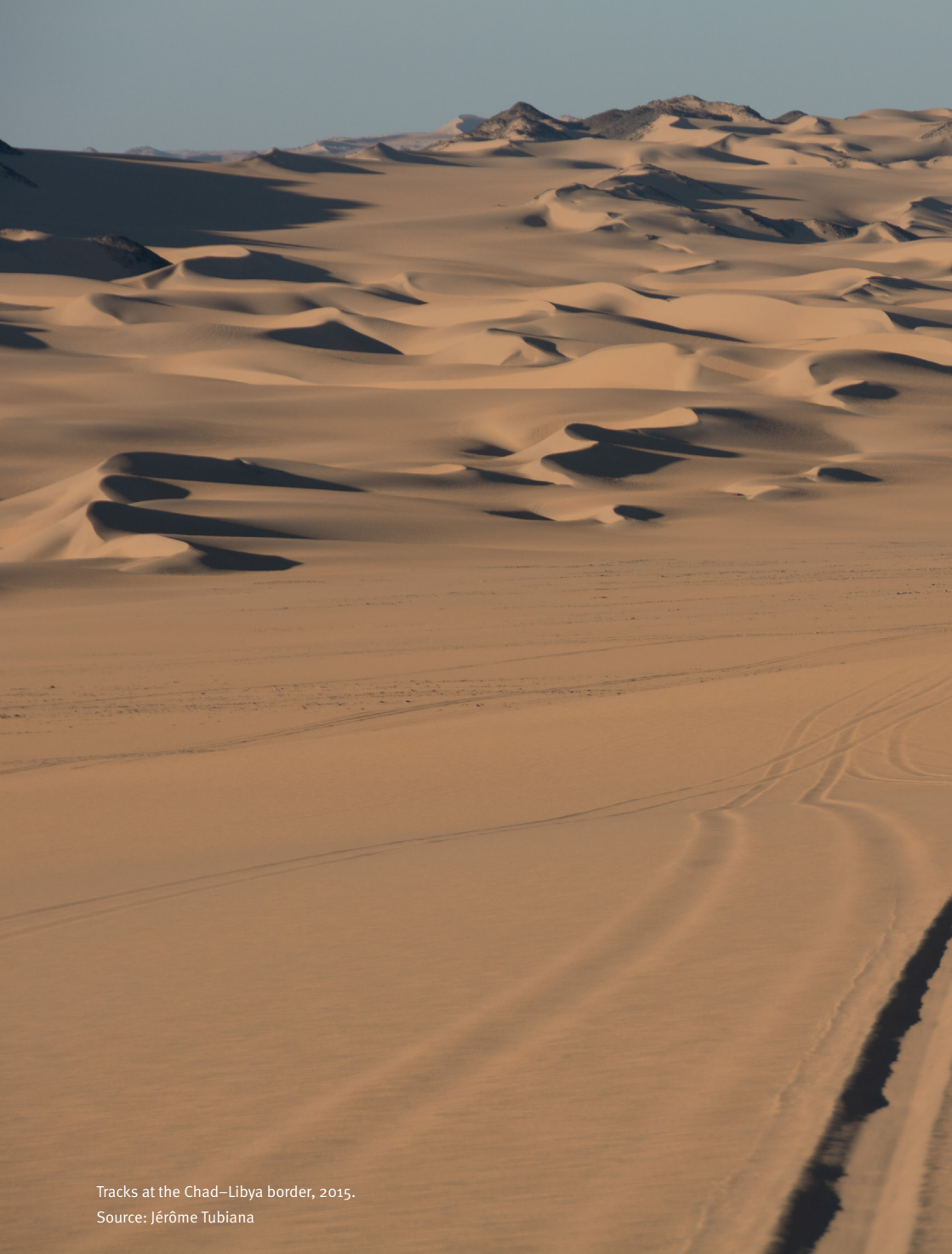
Tracks at the Chad–Libya border, 2015.