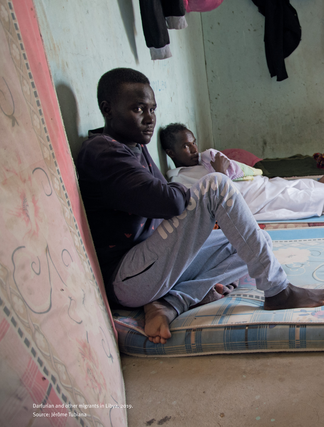
Darfurian and other migrants in Libya, 2019.